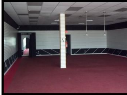
Available Space - Interior

Marketplace Mall is located on busy College Avenue in Appleton and is anchored by WG&R Furniture. Available spaces range from 960 sq.ft. to 24,894 sq.ft. Prices range between $6.00 per sq.ft. to $10.00 per sq.ft. annually.