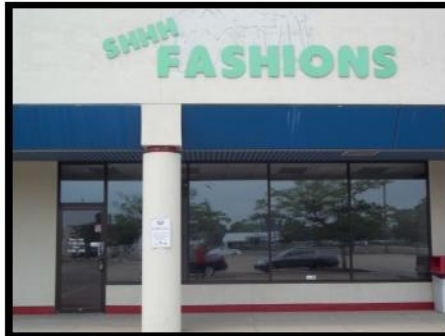
Available Space - Exterior