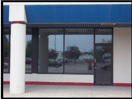
Available Space - Exterior