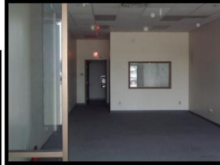
Available Space - Interior