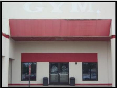
Available Space - Exterior