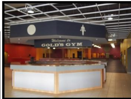
Available Space - Interior