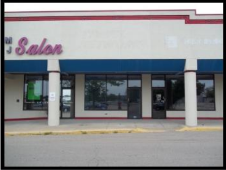
Available Space - Exterior