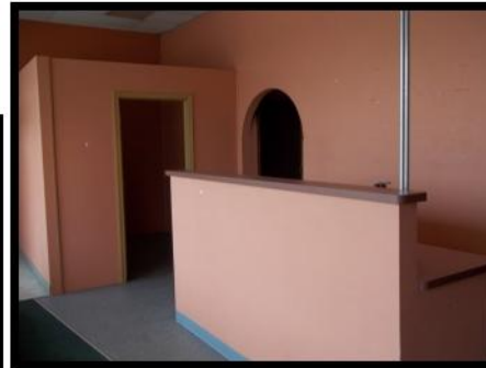
Available Space - Interior