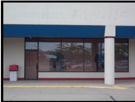
Available Space - Exterior