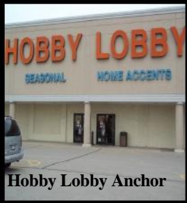
Hobby Lobby Anchor

The Koeller Center is located on the main retail frontage road to US Hwy 41 on Oshkosh's West side. Anchored by Staples and Hobby Lobby and adjacent to Walgreens this is a #1 Oshkosh retail location. Available spaces range from 1,000 sq.ft. to 12,000 sq.ft. (if spaces are combined).