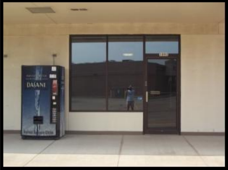
Available Space - Exterior